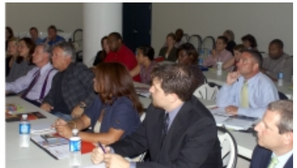
Lottery officials and marketing partners discuss strategy and product plans.

“There is a direct correlation between marketing initiatives and