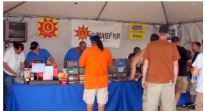
Event staff travels across the State to promote the Lottery’s latest games and promotions.

While summer is generally the Lottery’s busiest season, the Lottery will continue to promote its brand, product, and benefits messages at over 100 events throughout the year.