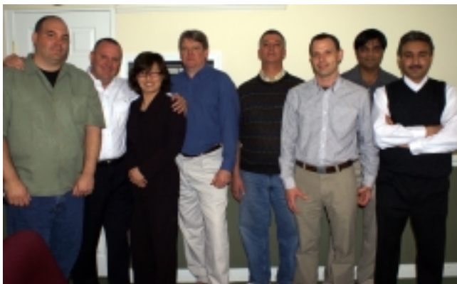
Lottery retailers attend a product forum to address product goals, industry trends, and retail tactics.

Maryland Lottery officials, product vendors, and several top Lottery retailers recently came together for a brainstorming and planning session. The session focused on current and future initiatives, product goals, industry trends, and retail tactics.