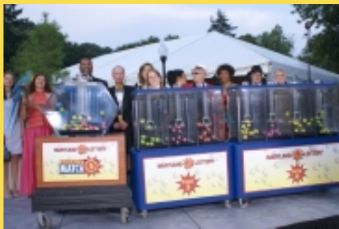
Lottery officials held a remote drawing at this year's Zoomerang

In an effort to give players and the general public a firsthand look at what it takes to conduct a Lottery drawing, an increased number of remote drawings have been scheduled at events statewide.